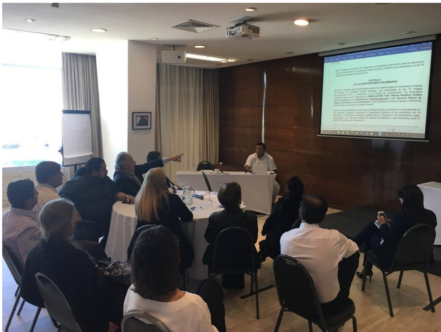
Group work at the OIE–IHSC workshop, Montevideo, Uruguay, 2017.

Successfully developing the capacity to support safe temporary importations of competition horses can only come from close collaboration between the public sector and the equine industry. These workshops foster collaboration and practical action and the impetus gained during these meetings must then be sustained at both the national and regional levels.