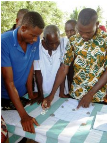
Participatory consultation, Burkina Faso

Inadequate logistics was highlighted as a major issue by the vaccinators using the three different protocols in both countries. For the most part, the amount that the breeders contributed to the vaccination costs was not considered to be a major issue by the farmers or the vaccinators. However, a farmers' lack of ability to pay his dues at the time of vaccination is often an issue and this is directly linked to the organisation of the campaign (the vaccination period,