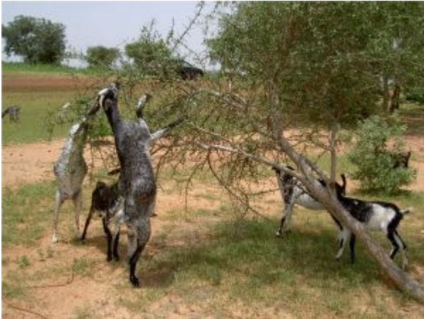
Mossi goats, Burkina Faso

Cost-benefit analysis revealed that PPR vaccination was highly profitable from the point of view of vaccinators and producers, regardless of the vaccination protocol, and that vaccination strategies with financial support (which represents an incentive for farmers) would be more viable in the medium and long terms, and probably more appropriate to achieve PPR eradication.