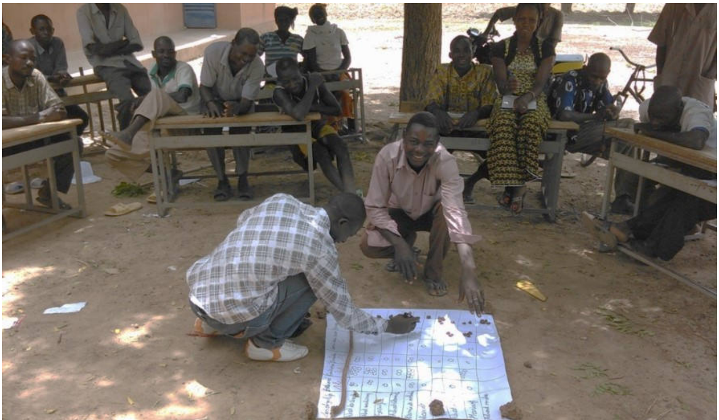
Participatory consultation, Burkina Faso