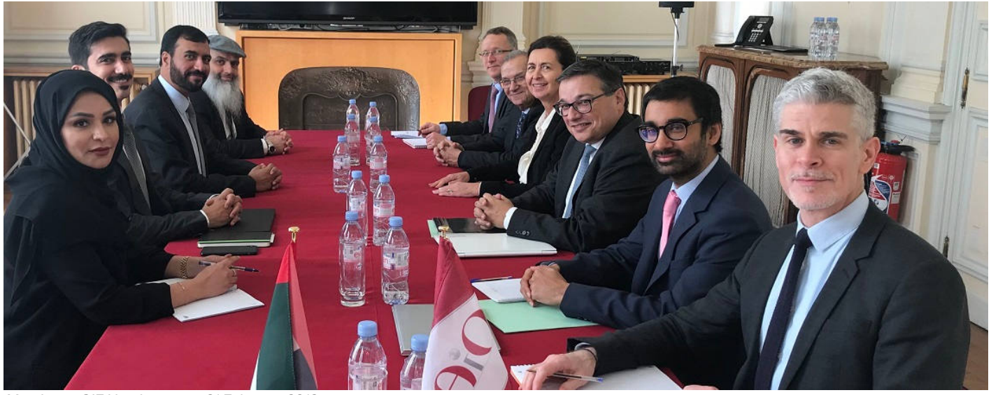
Meeting at OIE Headquarters, 21 February 2019

A provisional budget and work plan for 2020 have been discussed with the local authorities with a view to launching the activities of the new office, which which will be hosted by the Abu Dhabi Agriculture and Food Safety Authority (ADAFSA), will be inaugurated on 11 November 2019 at the Conference of the OIE Regional Commission for the Middle East.