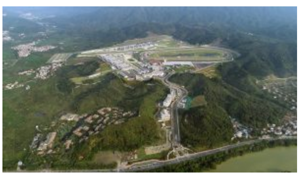
Conghua's EDFZ.

Understanding the movements of animals and animal products and being able to control them efficiently are essential to effective biosecurity. The movements of domestic equids, other animals and biological materials are only allowed into the EDFZ by permit and are subject to quarantine requirements. Quarantine requirements for Hong Kong racehorses travelling across the border have been jointly defined by the Hong Kong Agriculture, Fisheries and Conservation Department and mainland authorities, including the PRC Customs Department and Ministry of Agriculture and Rural Affairs. Signage, three quarantine checkpoint controls and random monitoring to prevent unauthorised entry into the core zone support these requirements.