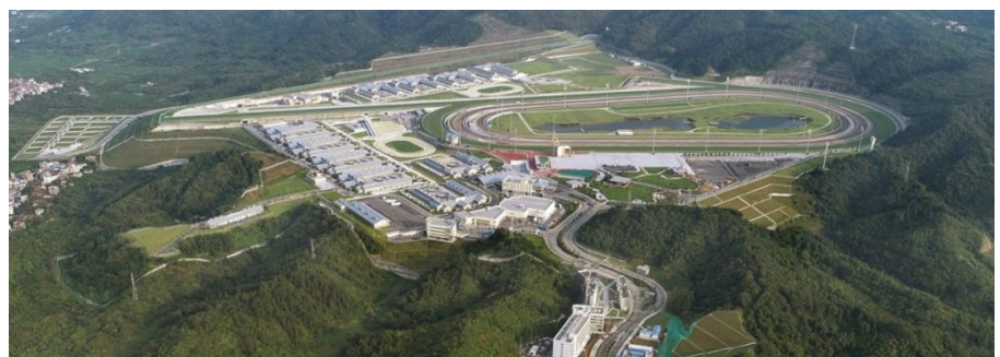
Conghua's EDFZ, partial view.

The views expressed in this article are solely the responsibility of the author(s). The mention of specific companies or products of manufacturers, whether or not these have been patented, does not imply that these have been endorsed or recommended by the OIE in preference to others of a similar nature that are not mentioned.